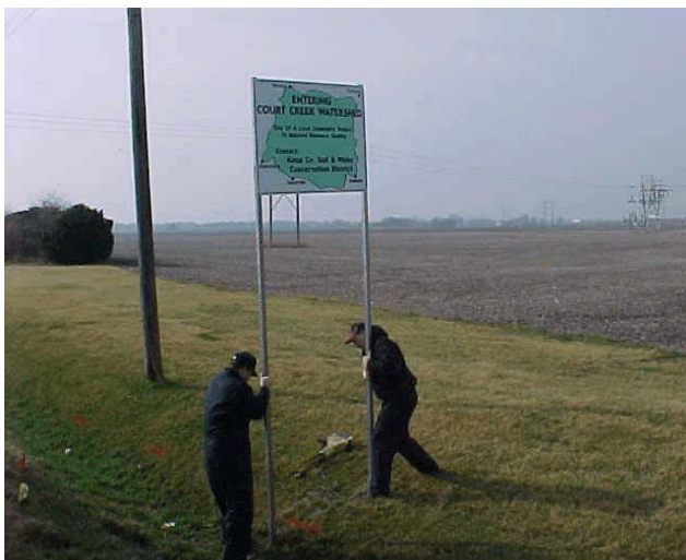
Figure 34. Watershed signs were placed at high visibility areas. Here, a Court Creek Watershed sign is installed.

boundaries. These signs were designed to raise public awareness of the watershed concept. Signs denoting significant streams were placed at bridges in each watershed (Figure 34).