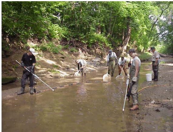
Figure 32. Fish (top), macroinvertebrates (middle) and habitat (bottom) are collected in each Pilot and Reference Watershed to assess the response of best management practices.

Due to the rigorous science-based assessments, the Pilot Watersheds have been nominated for designation as USEPA National Non-point Source Monitoring Program. In their report, Lombardo et al. (2000) support and recommend a study design similar to